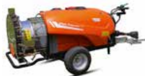
Italian diaphragm pump & German nozzles