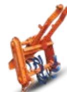
Heavy duty gearbox chain